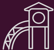
Kids Play Areas